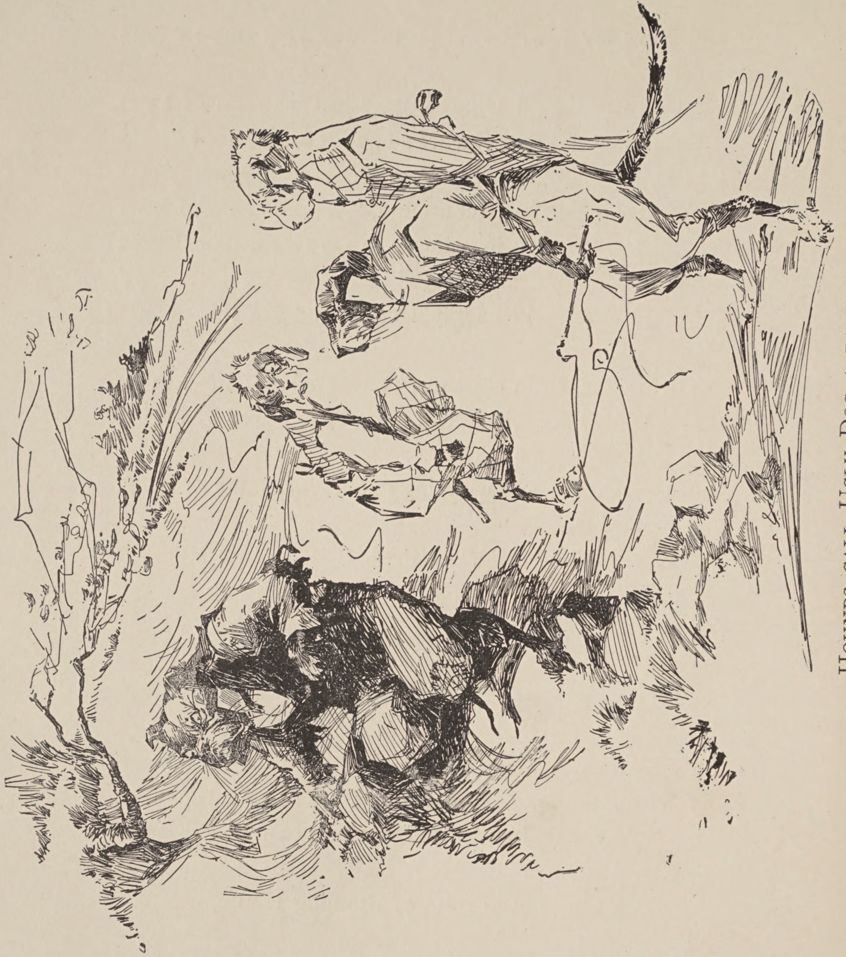
HOUNDS CALL UGLY DOG A RASCAL.